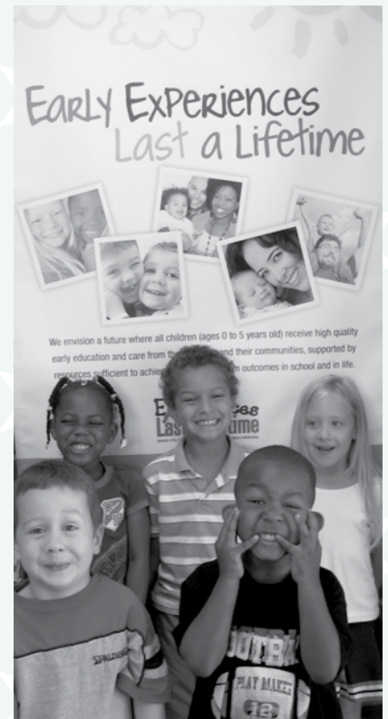
Children at the J.R. Coleman Child Care Center are excited about the Early Experiences campaign!

Many thanks to the Canton Area Association for the Education of Young Children for distributing the Early Experiences campaign banners that now hang in child care centers throughout Stark County.